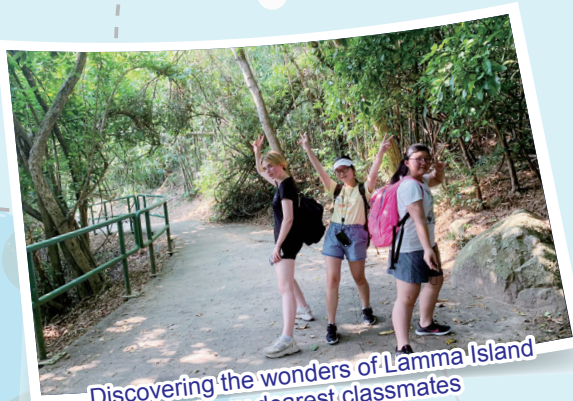
Discovering the wonders of Lamma Island with my dearest classmates

Besides all the outdoorsy activities, I had so much fun going shopping, going to the movies and going to karaoke with my friends from other schools or with other exchange students. I also have to mention the food culture, since I'm amazed how affordable eating out and other activities were! My favourite place in Hong Kong was definitely Tai Kwun, since I loved the JC Contemporary Art Gallery. I went there at least 20 times during my stay, and I never got bored of the exhibitions.