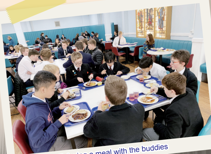
Enjoying a meal with the buddies