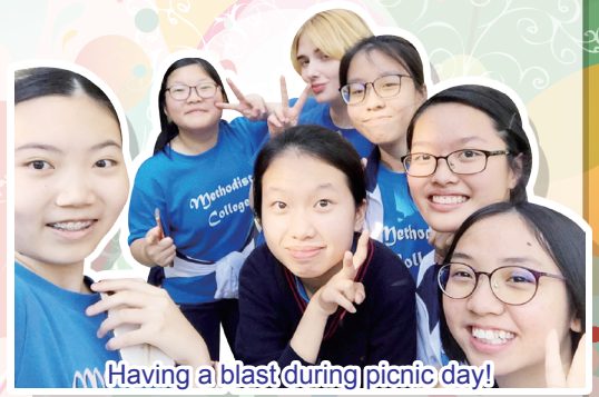
Having a blast during picnic day!