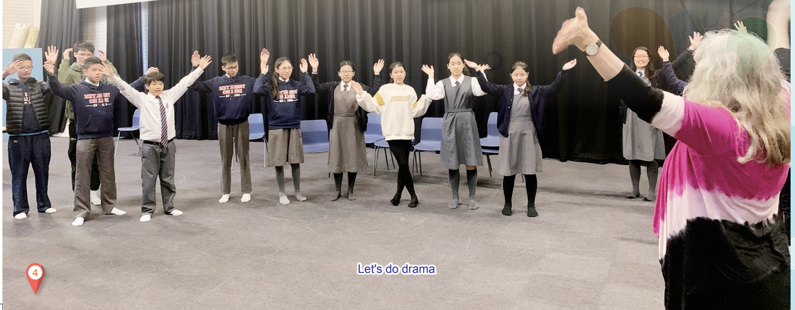
Let's do drama