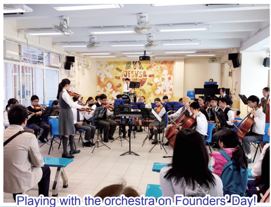
Playing with the orchestra on Founders' Day!

where I got to train for a bit. The school orchestra was a lot of fun and I met new friends there also! I have always loved music so it was great that I had an opportunity to play in the orchestra with so many talented students and enjoy the new music I played.