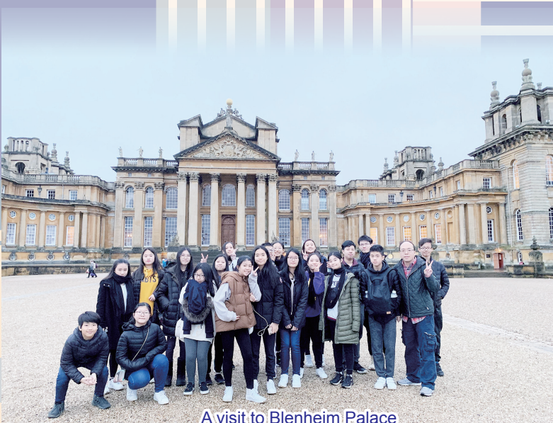
A visit to Blenheim Palace

We left the UK on the evening of 2 February and were back in Hong Kong the next day at around 4:00 pm. After dinner, almost all of us slept for half the day!