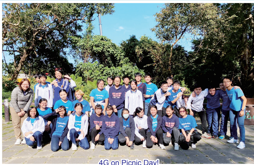
4G on Picnic Day!