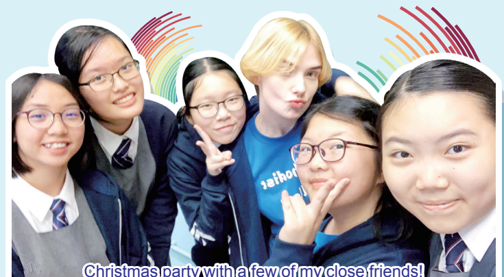
Christmas party with a few of my close friends!

When it comes to school life, I think it was undeniably the best part of my stay! Everyday I woke up feeling good about the day that was to come and I truly felt like I didn't have any worries. I really enjoyed the education system, even if it was much more strict than what I was used to in my home country. I didn't go too hard on myself with the subjects I chose, since I didn't benefit from the grades, so I just tried to choose subjects I enjoyed and what I wanted to experience the most, which was a great decision, now that I think about it. My favourite subjects were History and English! At the beginning of the school year, I got to choose some activities I wanted to try while studying in MC. I played in the school orchestra and later on I decided to audition for the school's dance team,