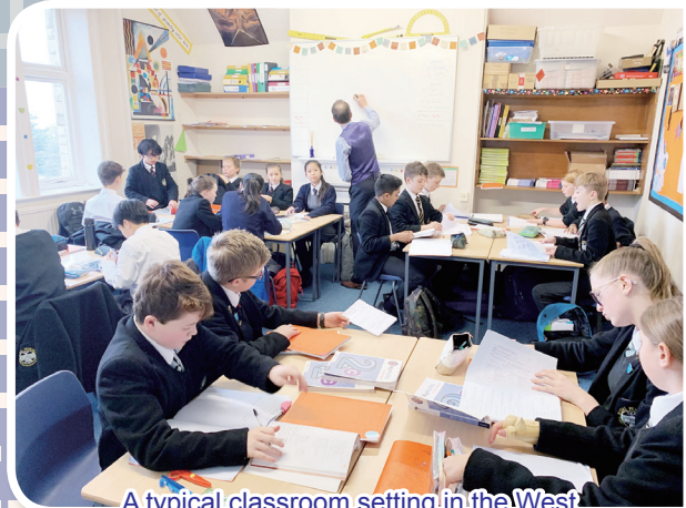
A typical classroom setting in the West

We left the school on the morning of 30 January, to begin our four-day sightseeing adventure. We visited several places, including Broadway, Cirencester, Blenheim Palace, and Oxford University, as well as Clarence House, Westminster Abbey, the London Eye, and the Natural History and British Museums in London. While we were taking the London Eye, the beautiful scenery impressed us a lot! The beautiful night view is unforgettable, and one which I think is worth going to.