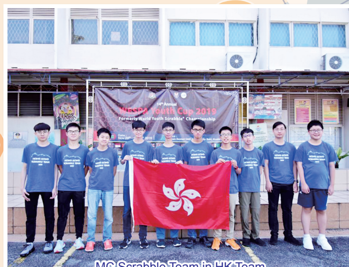
MC Scrabble Team in HK Team