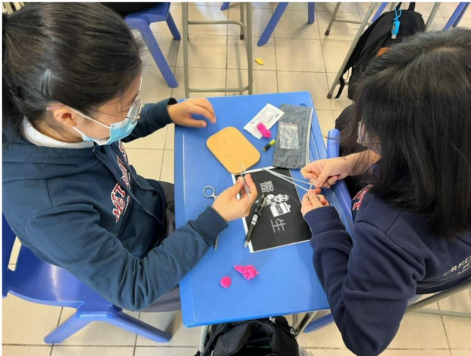
Students were experiencing the job of a doctor by performing a surgery.