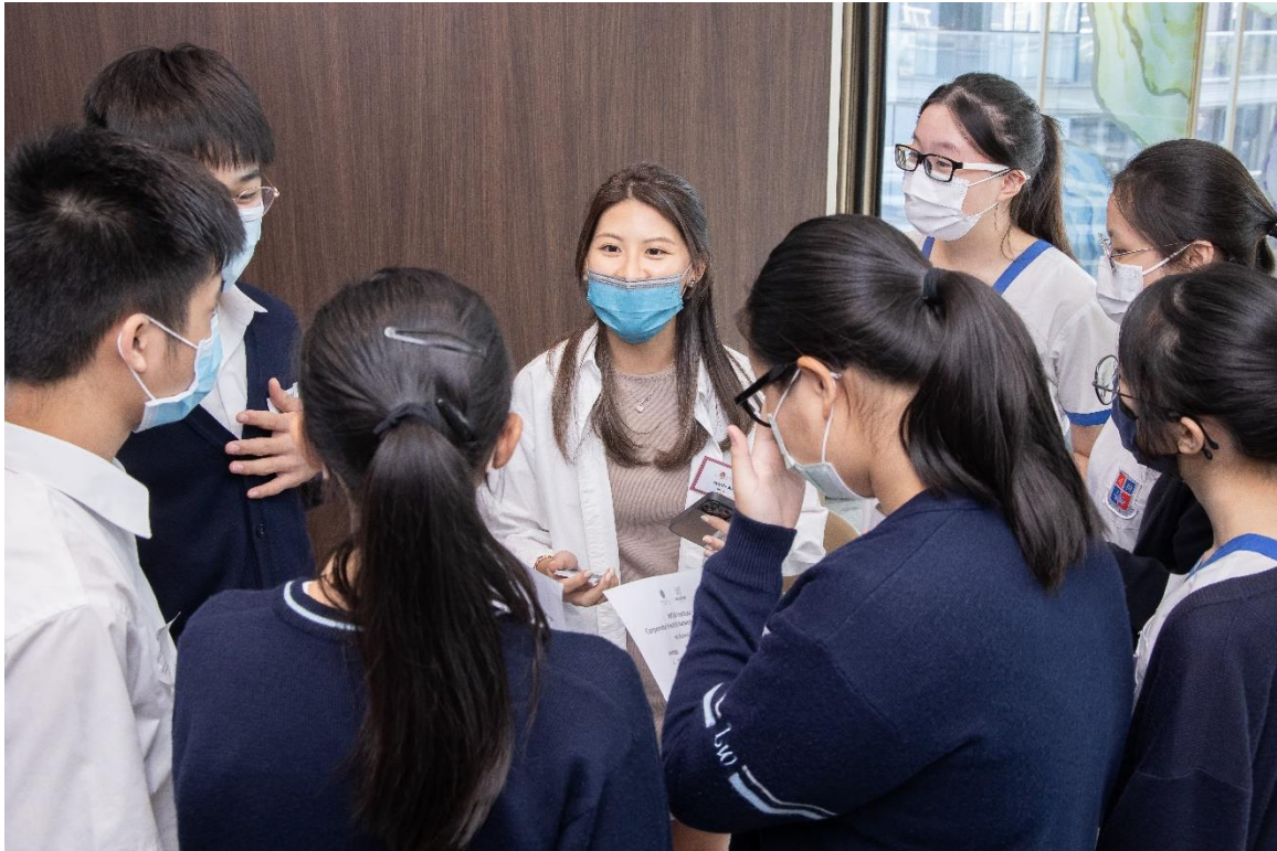
Talking with one of the Management Trainees

This WOW Institute Event was organized by CTF Education Group. The event consisted of sharing by industry leaders and human resources representatives, a round of “Network with Young Professionals and Mentors” where students can directly interact with the New World Development Group’s Management Trainees, as well as an exclusive guided tour.