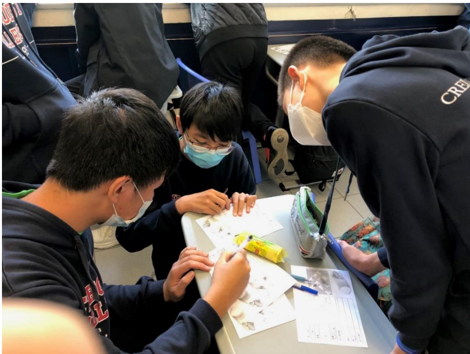
Students were experiencing the job of a Marketing planner.