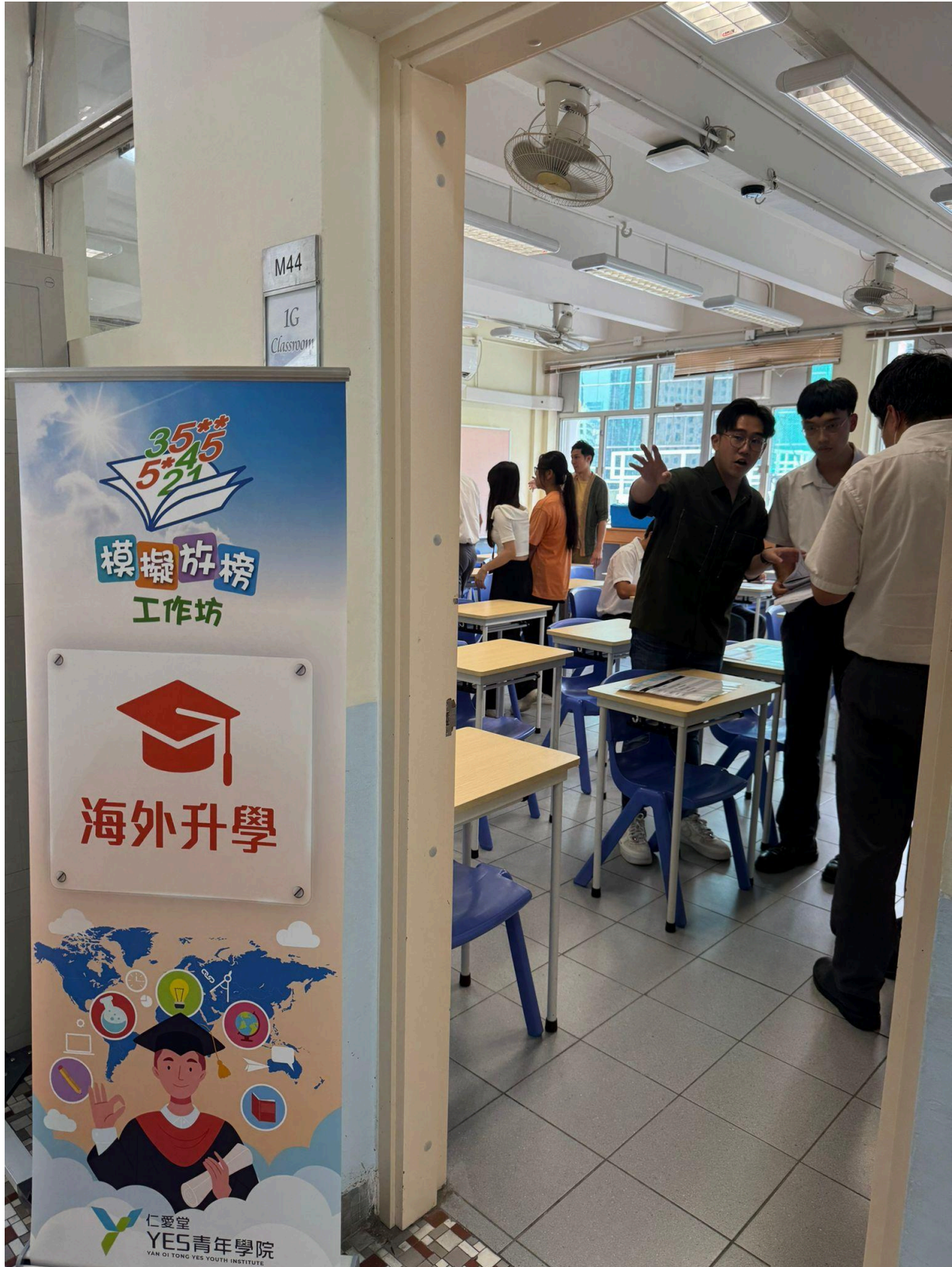
Students attending interviews.