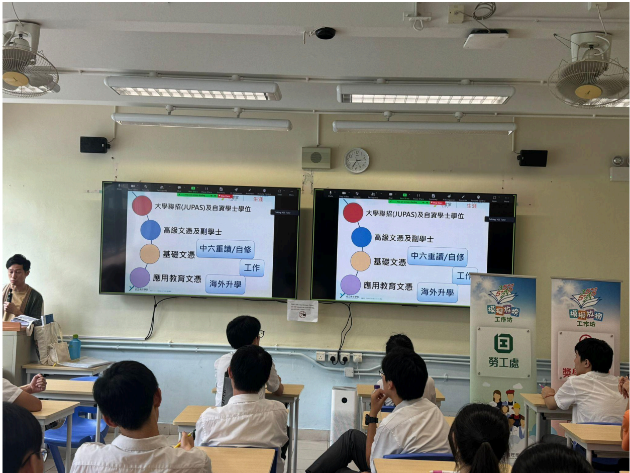
Students listening to the briefing.