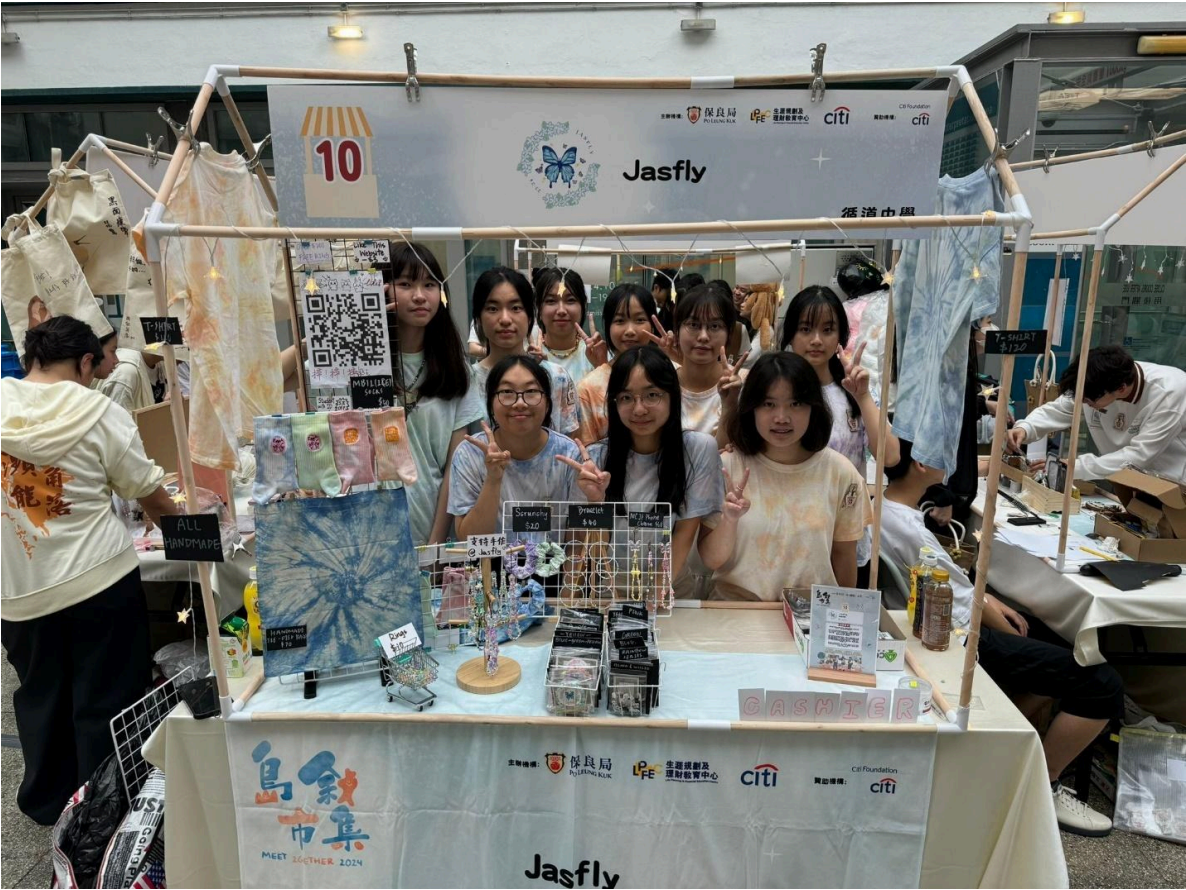
A group photo of Jasfly