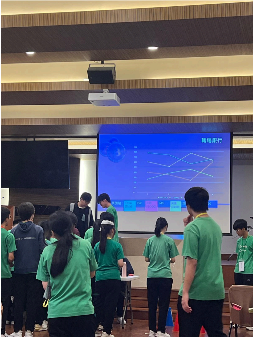
Students simulate trading investments to gain financial insights