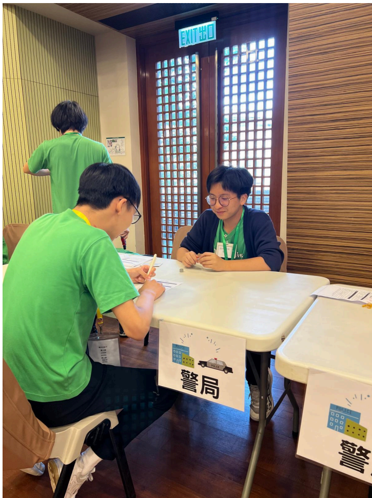
Students navigate reporting an incident at the simulated police station

Through a series of simulated workplace scenarios, students were able to experience firsthand process of job-seeking, employment, and various ups and downs of daily life. This hands-on approach allowed them to uncover their own interests, preferences, and potential career paths, enabling valuable reflections on their future goals and aspirations.