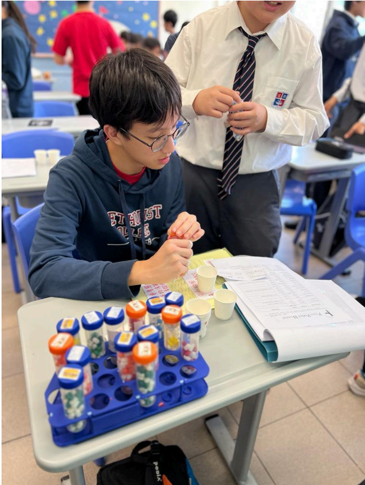
Students simulating a nurse dispensing medication.