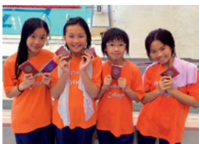
4x50m Medley Relay Girls C 3rd runner-up