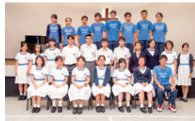
Junior Achievement Company Programme 2014-15