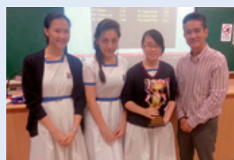
Hong Kong Secondary Schools Debating Competition