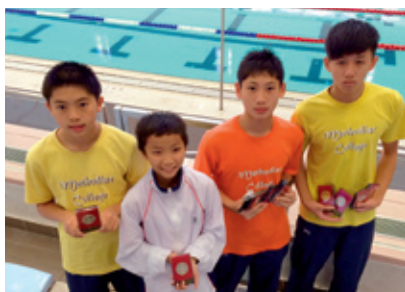
4x50m Free Style Relay Boys C Silver Medal