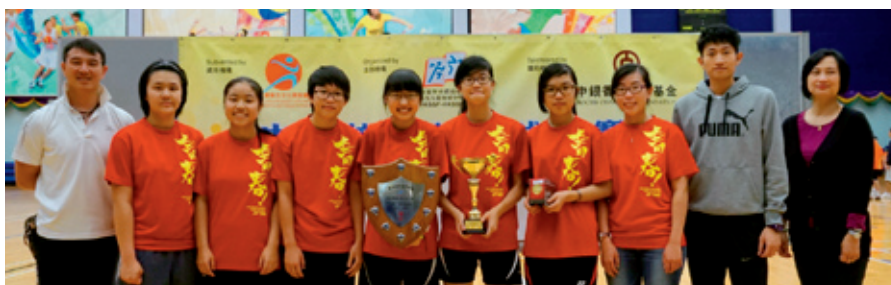
2014-2015 Inter-School Badminton Competition