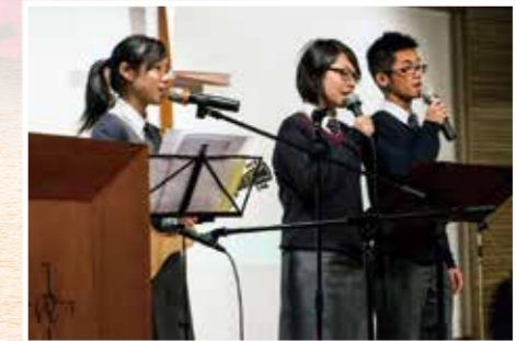
A praise and worship meeting by SCF in Evangelistic week 2014. 學生基督徒團契在 2014 福音週中的音樂敬拜分享會