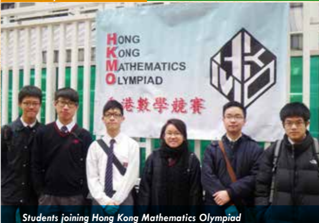
Students joining Hong Kong Mathematics Olympiad