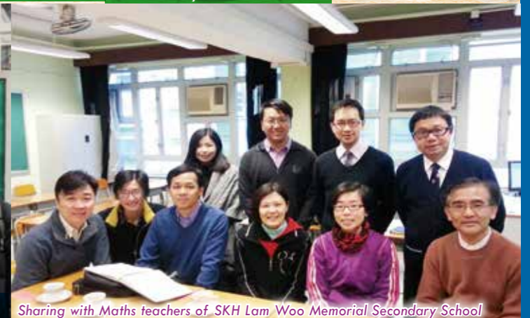
Sharing with Maths teachers of SKH Lam Woo Memorial Secondary School