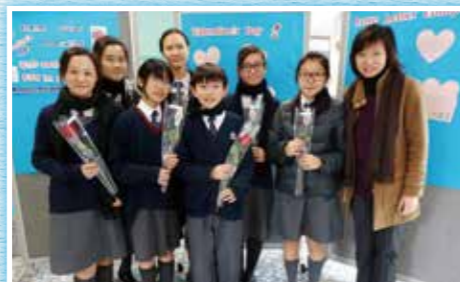
Sale of Flowers on Valentine's Day