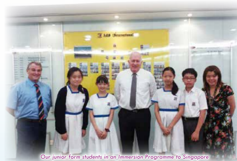
Our junior form students in an Immersion Programme to Singapore