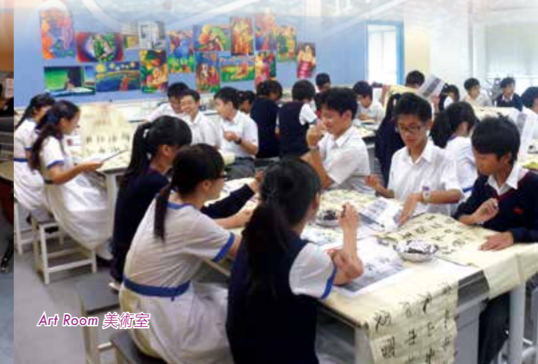
Art Room 美術室