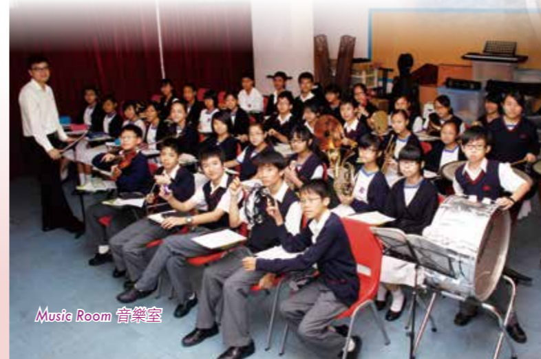
Music Room 音樂室