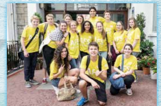
Plenty of flair at the AFS Intercultural Exchange Day