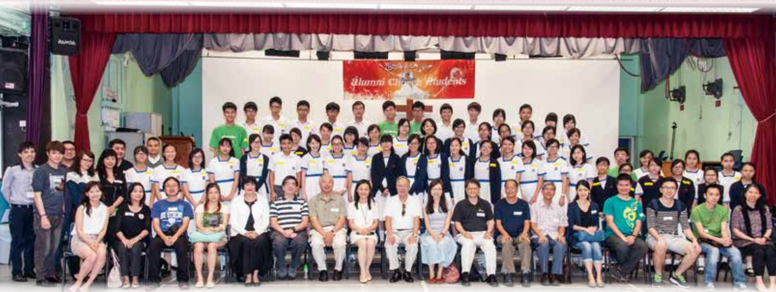
本校自 2009 年開辦「師徒計劃」，歷屆校友紛紛響應，回饋母校，擔任「師傅」，向「徒弟」分享人生及職場經驗。