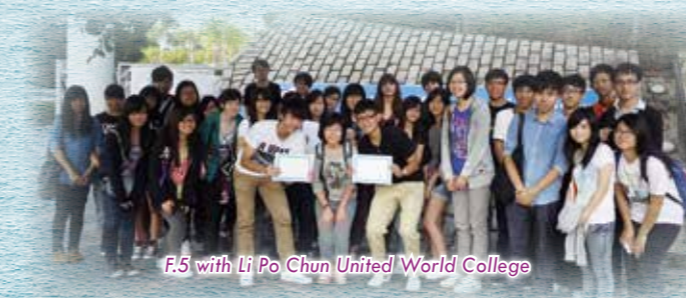
F.5 with Li Po Chun United World College