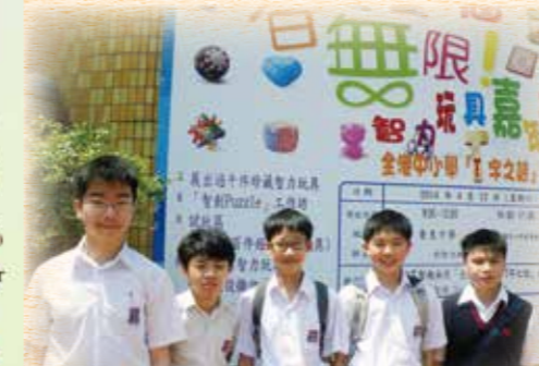
Students joining Mathematics Competitions