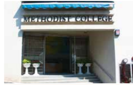
East wing 東翼