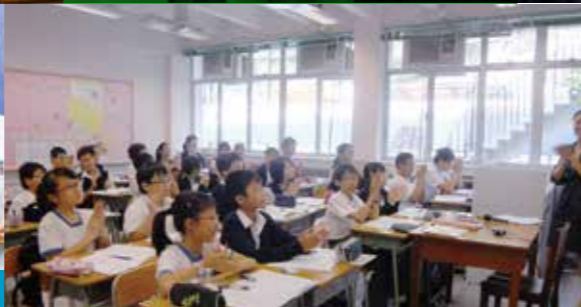
同學們上課投入，樂於學習。