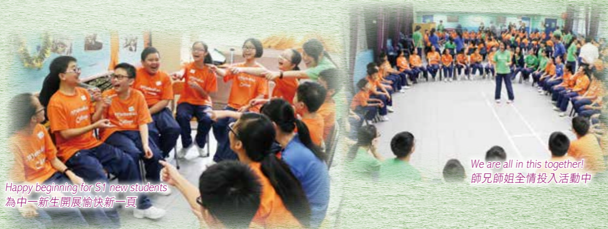
Happy beginning for S1 new students 為中一新生開展愉快新一頁