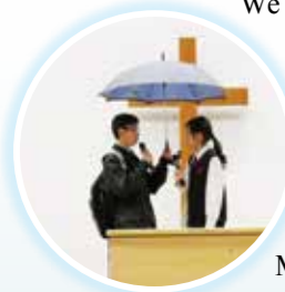
Rain, hail or shine. It's always fun at English Time!

We provide a plethora of opportunities to expose our students to English and engage them in a wide range of authentic English situations, so as to develop their overall confidence and ability to effectively converse in English.