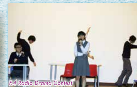
F.4 Radio Drama Contest