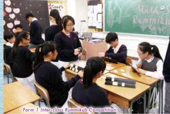
Form 1 Inter-class Rummikub Competition