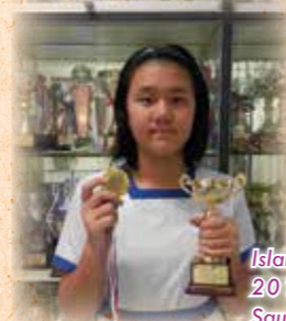
Island District Squash Competition 2013 and Sai Kung District Squash Competition 2013