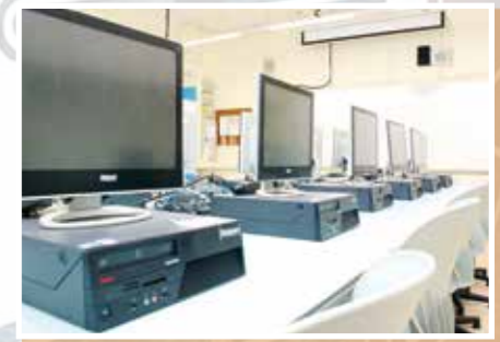
Computer Room 電腦室

本校共有 4 座：主樓於 1958 年創校時落成，北翼是為了容納激增的學生而於 1963 年建成；南翼為教育署斥資的學校改善工程，在 2005 年竣工，紓緩了校舍擁擠的情況；2011 年隨著循道學校遷往新址，則加添了另一校舍——東翼，正好配合新高中課程的需要。除了課室數量大增外，活動空間亦得以擴充。小組研習室及供高中生使用的自修室相繼啟用。課室均設有空調，並裝有電腦及投影器輔助教學。全校老師配備手提或桌面電腦，作備課及教學用途；光纖及無線網絡覆蓋全校園，支援資訊科技教學。此外，本校設有校園電視台錄影室及製作室，為學生提供多元化學習，增加他們溝通及創作的機會。