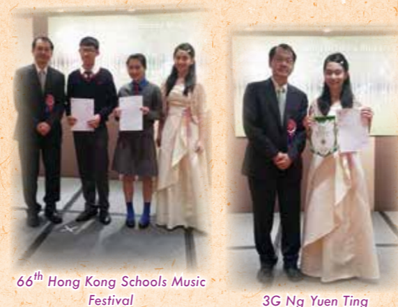
66 th Hong Kong Schools Music Festival