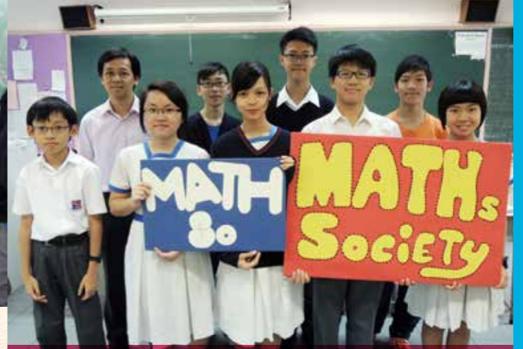
Advisor, Committee Members and Members of the Mathematics Society