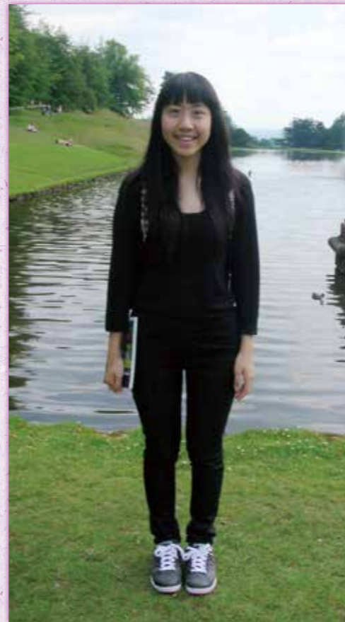
On Immersion Program to the UK funded by the college in 2011

Thanks for providing me with a solid foundation to be well prepared for future challenges. I hope everyone at Methodist College will lead a joyous and bountiful life!