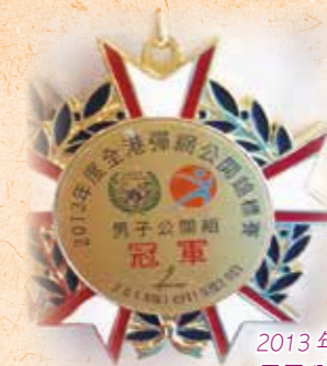
2013 年度全港彈網公開錦標賽 男子公開組冠軍 - 4W 文日羲