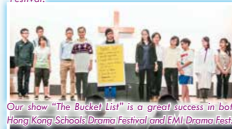
Our show "The Bucket List" is a great success in both Hong Kong Schools Drama Festival and EMI Drama Fest.