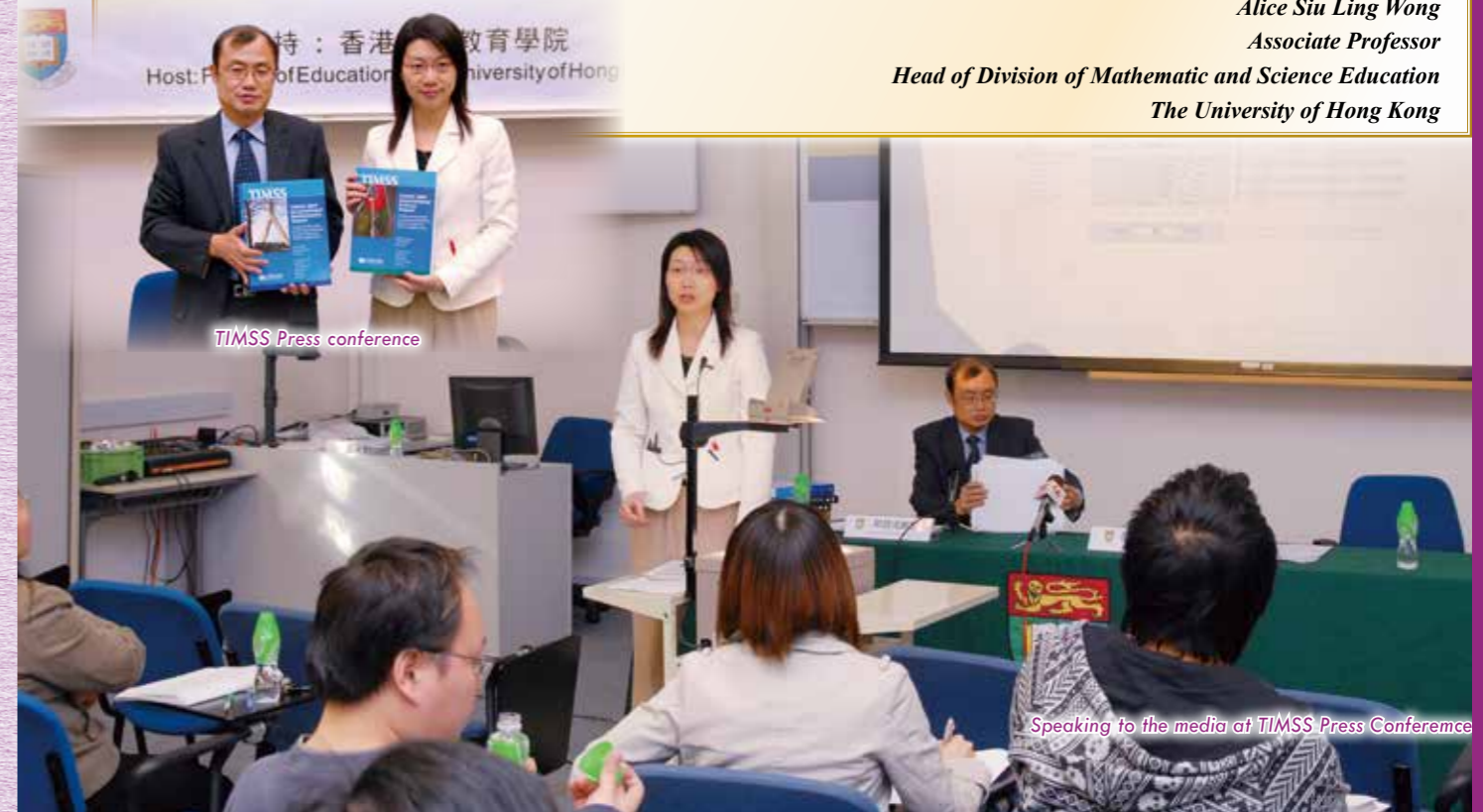
TIMSS Press conference