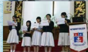
F.3 Radio Drama Competition