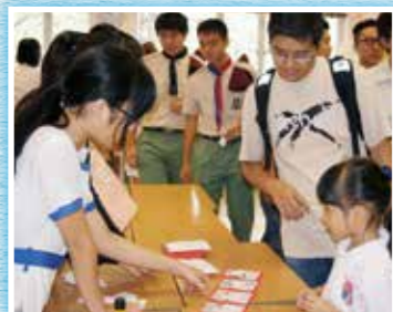
Game stalls organized by English Society

Outside the school, we have a strong presence as our students compete and participate in many external competitions, examples being the Speech Festival, the Mock Trial Programme, Singtao Interschool Debating Competition, EMI Drama Fest, Hong Kong Schools Drama Festival, drama & presentations for primary schools, Inter-school scrabble competitions and the Model United Nations Conference.