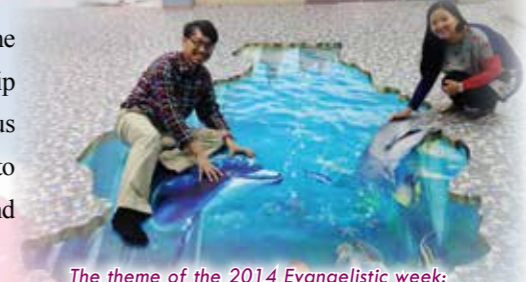
The theme of the 2014 Evangelistic week: the Lake of Grace 2014 福音週主題：滴恩湖

本校是一所建基於基督精神的學校，我們是希望透過舉辦不同形式的活動（包括福音週、學生基督徒團契及學生福音營會等），讓學生有機會認識福音、從而得著豐盛的生命。