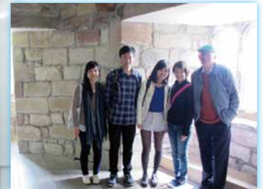
Immersion Programme to UK