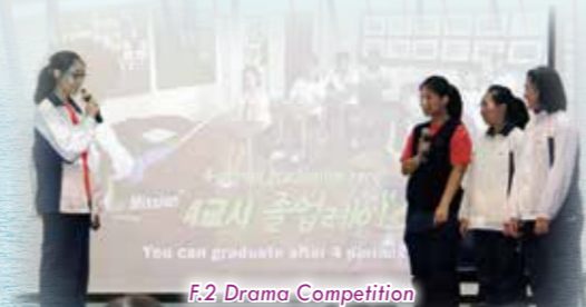
F.2 Drama Competition