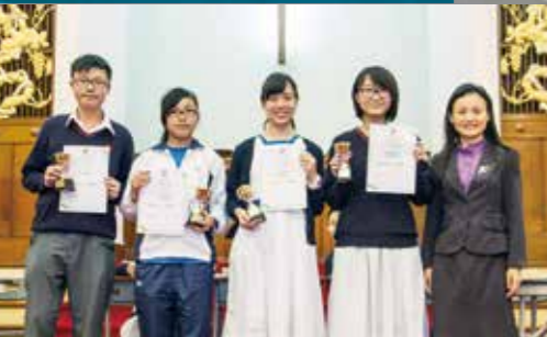
中三級班際辯論比賽。