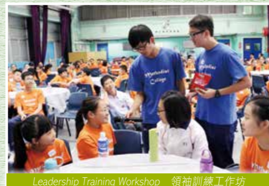
Leadership Training Workshop 領袖訓練工作坊