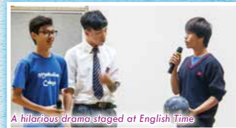
A hilarious drama staged at English Time