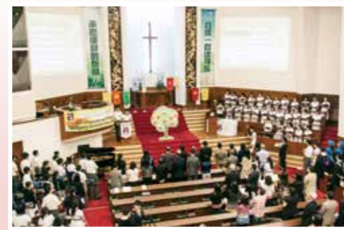
校祖日感恩崇拜暨頒獎典禮