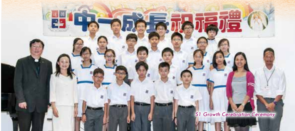
S1 Growth Celebration Ceremony

中一：自我發現之旅；中二：自我管理；中三：尋找生命的色彩（生涯規劃）；中四：僕人、領導；中五：環境教育、世界公民、多元文化；中六：情緒教育、心理健康；