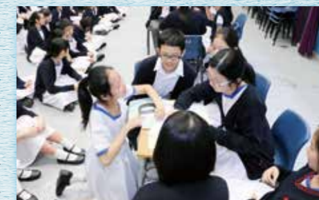
The thrilling Battle of Books

As our students reach the senior secondary forms, they are well prepared to undertake and meet the challenges of the senior English Curriculum. Through the vigorous and challenging lessons, our students are committed to achieving the highest exam results possible. The elective modules have been integrated in our core curriculum, so as to expose our students to an array of learning experience in pop culture, short stories, workplace communication and social issues.