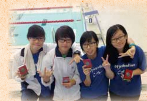
2013-14 年度港島及九龍地區中學校際游泳比賽