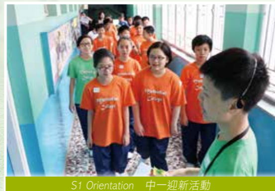
S1 Orientation 中一迎新活動

In the scheme, the senior form students act as servant leaders to serve their 'brothers and sisters' at school. We believe that our S1 students, who have experienced the love and care of the senior students, will pass the spirit on and become big brothers and sisters for the future freshers.