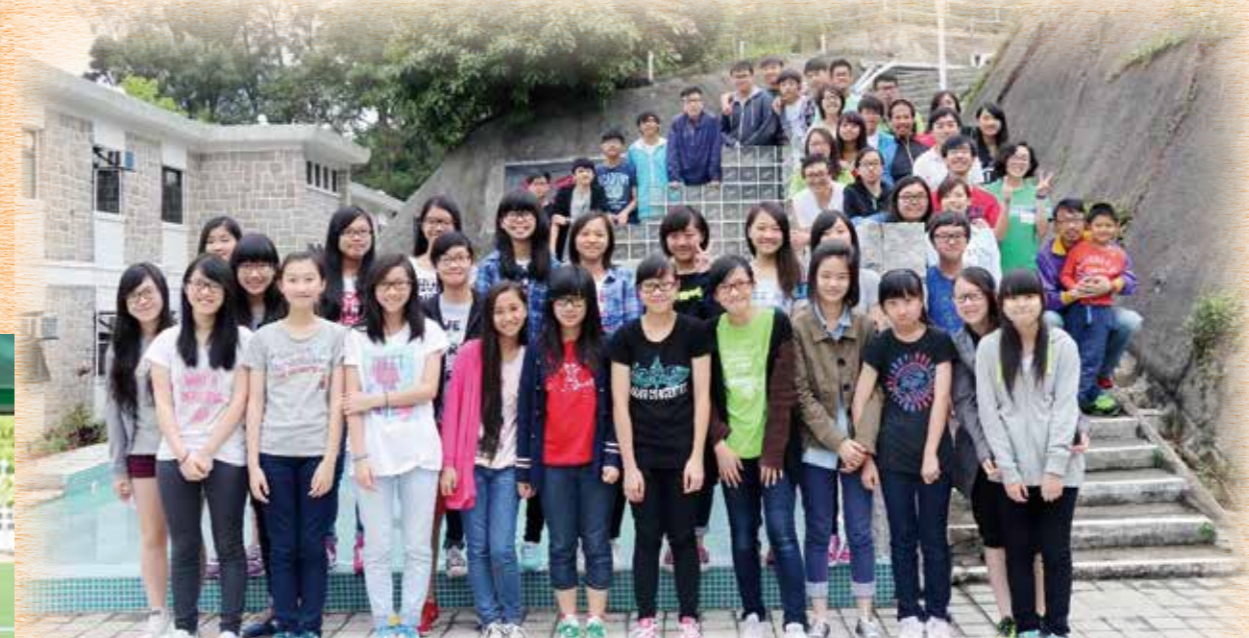
2014 Easter SCF Camp 2014 復活節團契生活營 Photo of all the participated students and teachers 老師和同學大合照