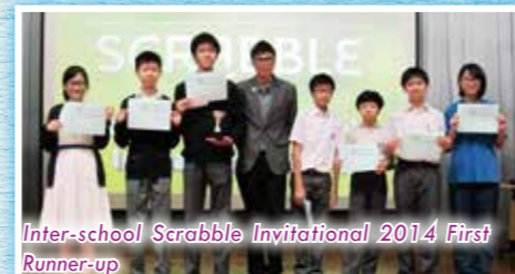
Inter-school Scrabble Invitational 2014 First Runner-up