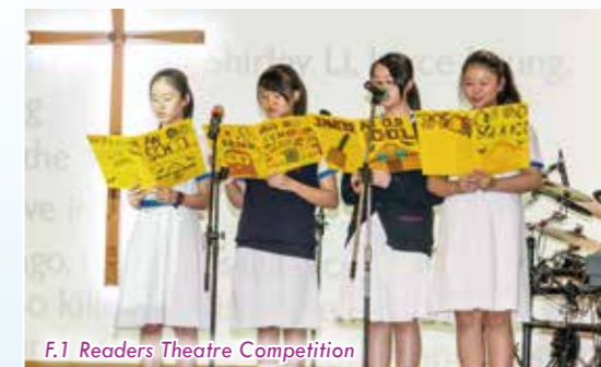
F.1 Readers Theatre Competition

The English Department provides students with a tailor-made curriculum with learning experiences to improve their language proficiency, develop their knowledge, skills, values and attitudes, and promote lifelong learning so as to enhance their personal and intellectual development, cultural understanding and global competitiveness.