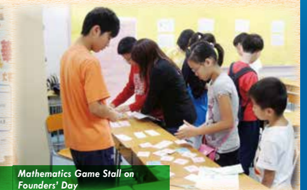
Mathematics Game Stall on Founders' Day