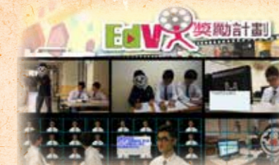
「EdV 獎勵計劃」- 「最受歡迎短片」 5B 謝昭進 黃明希 司徒焯楠 關灝麟