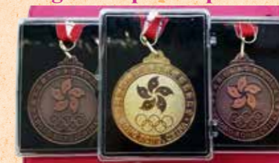
Samsung 57 th Festival of Sports 2014 Tenpin Bowling Championship

Youth Doubles (Boys/ Girls/ Mixed) 1 st runner-up