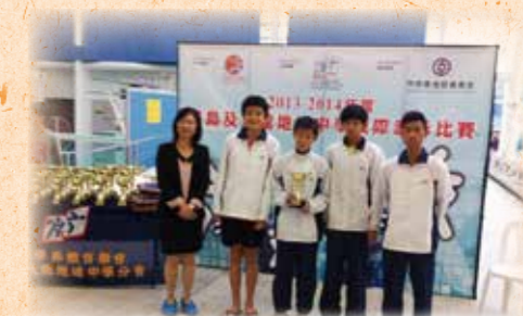
2013-14 年度港島及九龍地區中學校際游泳比賽 男子丙組團體全場第三名